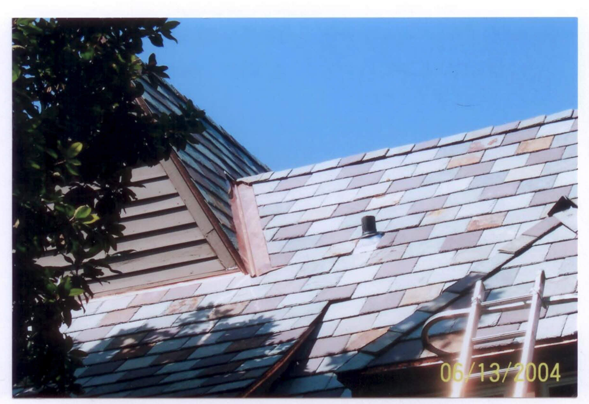
Picture #6 We are proud to do our detail work with quality and conviction.

Picture #5 The craftsmen at Braden Roofing did a very nice job installing this valley, clean and straight.