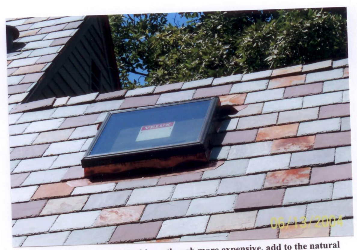
Picture #10 Copper flashings, though more expensive, add to the natural beauty of slate.